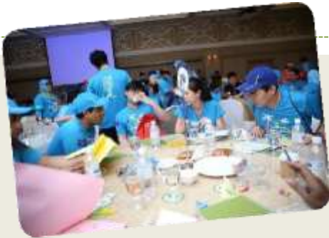
HRDF Training Courses