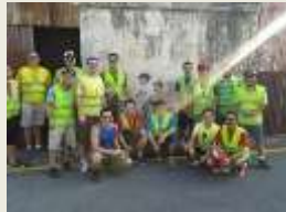
First Solar US 16/2/2013