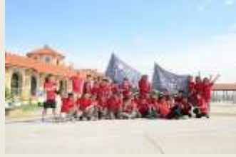
Four Points Hotel 1/11/2014