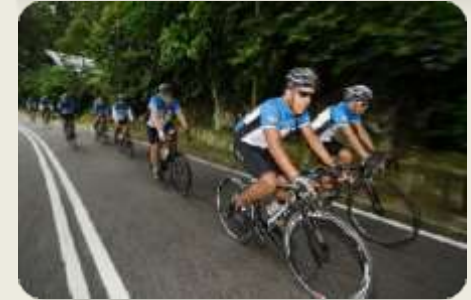
Round Island Cycling