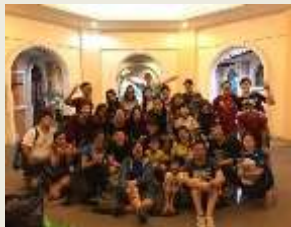
Handshake Tech.SG 18/11/2016