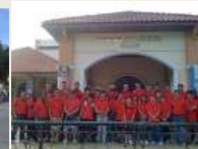
Coca-Cola Msia 30/9/2012