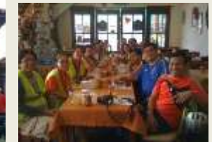
Monsanto SG 14/12/2012