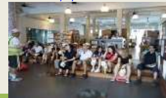
BOSCH APAC 8/6/2016