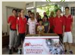
Ingersoll Rand 29/11/2014