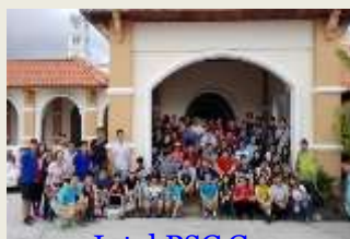
Intel PSG Group 9/10/2017