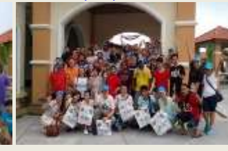
JTI SEA 24/10/2015