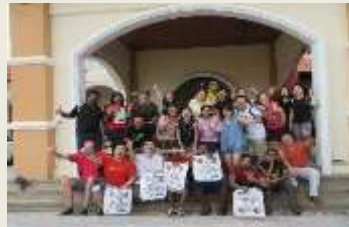
Motorola Solutions 25/1/2017