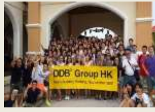
DDB Group HK 18/9/2015