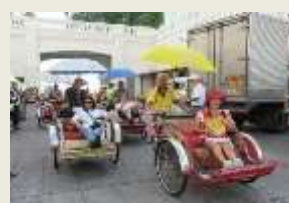
60 th Birthday Trishaw Treasure Hunt 29/4/2017