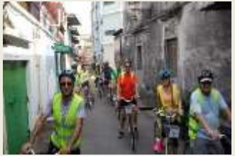
First Solar International 12/6/2015