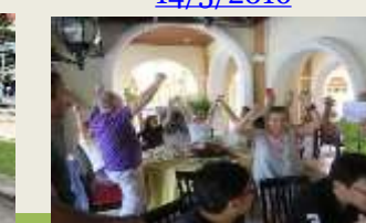
KFC ASIA 8/9/2016