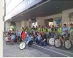
UOB PG HQ 12/5/2012