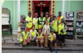
Bromma Ipoh 13/10/2014