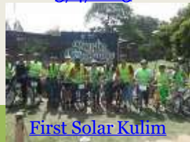
First Solar Kulim 13/12/2013