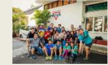
YMCA HK 7/1/2016