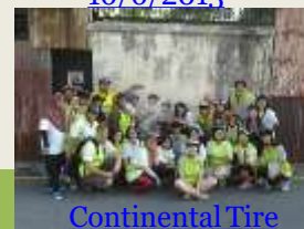
Continental Tire 23/2/2014