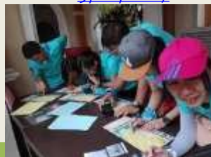
Ferring Pharmaceuticals. 12/1/2018