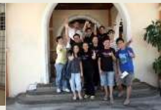
Samsung PG 14/12/2014