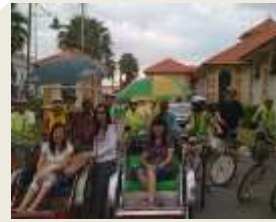
Jabil PG 19/4/2012