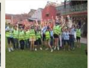
UOB BM 9/6/2012