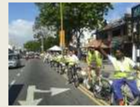
PTS Properties Melaka 29/6/2013