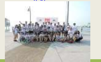
TTG ASIA 4/7/2016