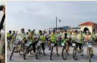
CWM Group 14/5/2016