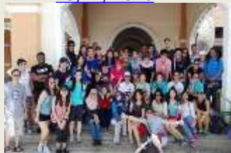
Intel Global Supply Group 18/7/2017