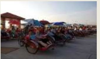
APPLE APAC 22/1/2016