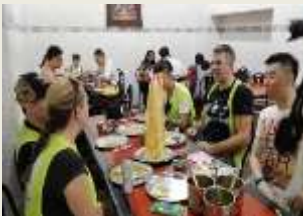
IPinGlobal SG 20/3/2016