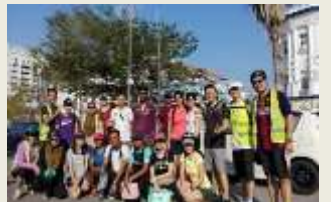
Intel PG 04/3/2016