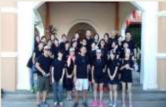
Pfizer SEA 12/5/2015