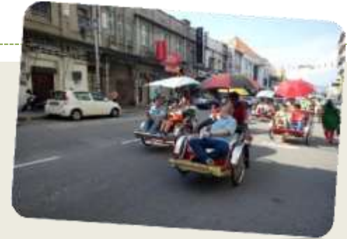
Heritage Trishaw Tour