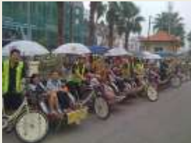
UOB Kelawei 30/6/2012