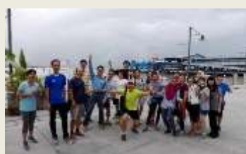
Flex Global Supply 13/10/2017