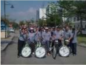
Eastin Hotel 29/10/2010