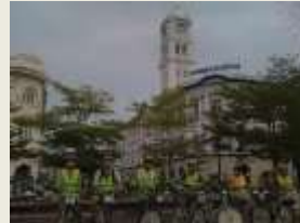
Fullerton SG 8/9/2012