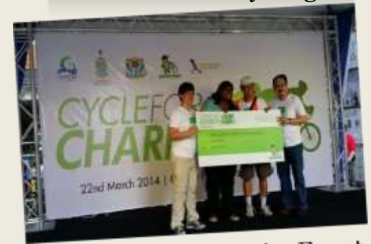
Cycling For Charity Event