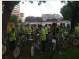
Great Eastern Insurance 8/9/2012