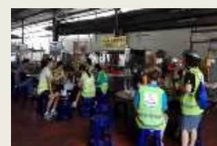
Intel IE Group 29/5/2017