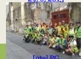
Intel PG 3/3/2014