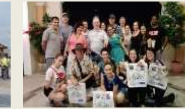
Flextronic Int. 18/5/2016