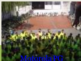
Motorola PG 31/10/2013