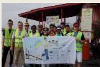
Penang PCET 15/1/2017