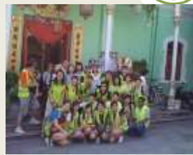
AMD PG 16/3/2012