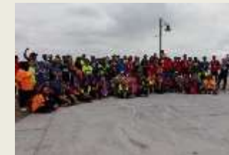
Northern Corridor Implementation Authority (NCIA) -30/11/2017