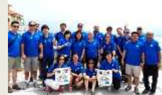
Pfizer International 9/11/2016