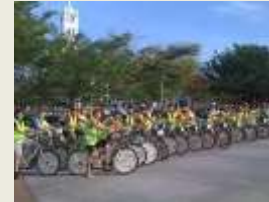
KPMG SG 30/9/2012