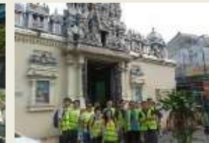
Altera PG 19/8/2013