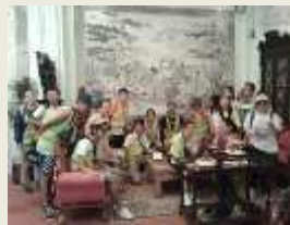
Panasonic Kulim 3/4/2013