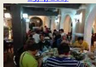
Japan Matsui Group 23/11/2017