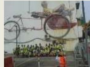
Plexus PG 16/6/2013