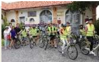
Crowe Howath SG 3/10/2016