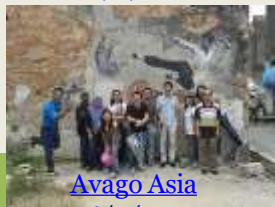
Avago Asia 26/9/2013