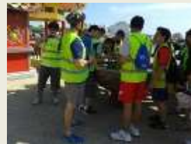
Intel PG 1/3/2013