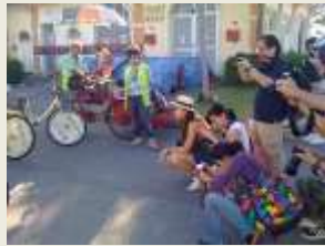
HG Media Group 5/1/2012