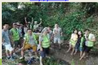
1985 Chung Ling High School Reunion 30/12/2017